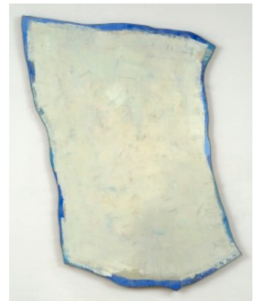
OPEN SKY, 2014

One of his most innovative shows was of true three dimensional paintings; again of landscapes but this time somewhat more urban. The remnants of architecture appear as buildings that protrude from the wall. A corner view might be held in perspective or a courtyard would be suggested by three walls.