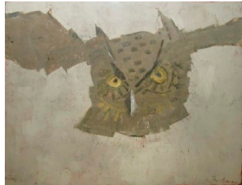
OWL AT DUSK, 2005