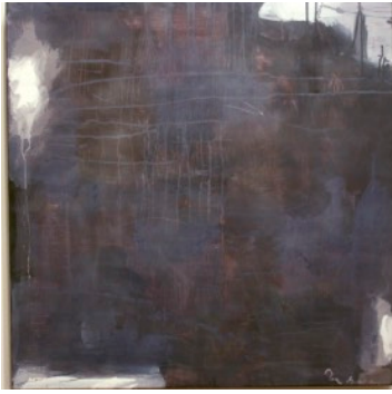
DARK OF NIGHT. 2009

In the late 1990s, Goldberg exhibited a group of landscapes depicting the familiar forms such as gorges, ridges, fields as well as Soap Lake in Eastern Washington, where the artist had been living since 1984. These land, sky and waterscapes revealed that this appreciation of the natural world has been the most enduring images in Goldberg's work. In more recent paintings, Goldberg adds elements of weather and observations of the sky to these abstracted landscapes. Lightning, to be more specific, was a recurring theme in a number of works. Other paintings are overtly representational with figurative elements in the forms of silhouettes and skeletons, as well as group of haunting paintings of owls in flight.